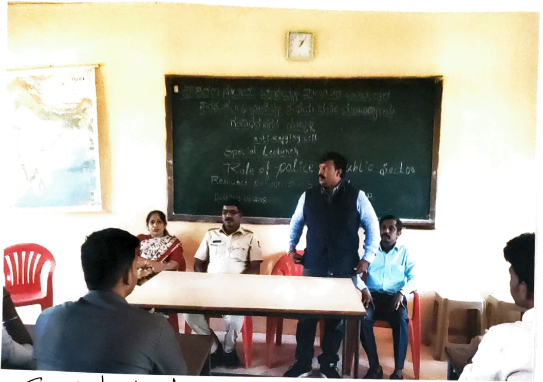
Special Lecture On "The Role of Police in Public Sector"